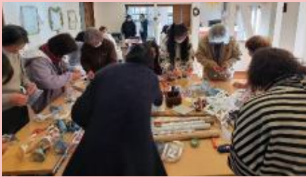
Christmas craft café

Thank you for praying for the Christmas events at our church. Praise God that many people have heard the Gospel and taken tracts home with