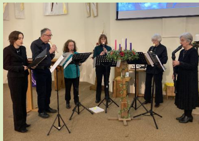
St Luke's Recorder Consort in action at the Carols by Candlelight service

The recorder is often associated with early music and school classrooms but it holds a significant place in the history of sacred music. Its pure ethereal tones have graced church services for centuries making it an enduring sound for worship and spiritual expression.