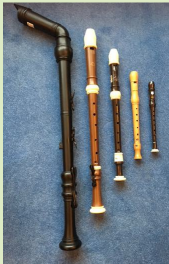
My collection of recorders, from left to right: Bass, Tenor, Treble/Alto, Descant/Soprano and Sopranino

Each recorder in the family also differs in size and tone. For example, the descant/soprano recorder is small and light while the bass is much larger and requires more air to produce sound.