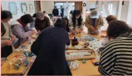
Christmas craft café

Thank you for praying for the Christmas events at our church. Praise God that many people have heard the Gospel and taken tracts home with