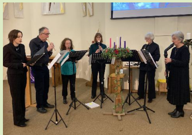
St Luke's Recorder Consort in action at the Carols by Candlelight service

The recorder is often associated with early music and school classrooms but it holds a significant place in the history of sacred music. Its pure ethereal tones have graced church services for centuries making it an enduring sound for worship and spiritual expression.