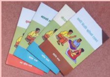
Good News picture book in various languages

Never before have I arrived in Nepal without making plans but it was good to make contact with the translation office and to meet various minority language translation teams. Although the teams' main work is NT and some OT translation, they also work on some 'advertising' materials which are printed. One of these publications, Good News , containing pictures and text, looked ideal for digital format. I collected the