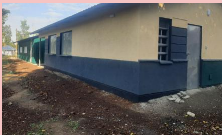
New kitchen and dining room at a local secondary school is almost finished and ready to provide meals for 1000 undernourished children

If anyone is interested in sponsoring any of the children in Kisumu do please ask me for more details.