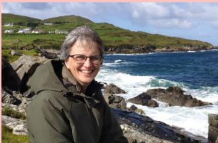
On the coast of Donegal, Ireland

I enjoyed joining a group via Zoom to discuss one of the 25 areas that the Lausanne Movement has identified as 'gaps' in fulfilling the Great Commission. We looked at 'creation care and the vulnerable'. It was good having interaction with people all over the world, including Brazil, the USA, Australia, the Philippines, India, the Middle East, Greece and Norway.