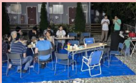
Nabe (Japanese Hot Pot) Party – praise God for good food and fellowship and for the two non-Christians who came