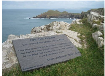
Memorial to the Poem For the Fallen by Laurence Binyon on Pentire Head near Padstow.

They shall grow not old, as we that are left grow old, Age shall not weary them, nor the years condemn. At the going down of the sun, and in the morning, We will remember them.