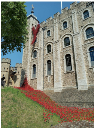
One of the ceramic poppy displays at the Tower of London, 6th May–11th November 2025, to commemorate 80 years since the end of the Second World War

British armed forces suffered casualties at the Battle of Mons on 23rd August 1914, the Battle of Le Cateau on 26th August and the First Battle of the Marne, 5th-9th September. These events provided the context for Binyon’s poem which he penned in mid September 1914 while he was sitting on a cliff top looking out to sea. Binyon recalled later that the famous verse, which is the fourth verse of seven, came to him first. The poem was published in The Times on 21st September 1914 and the fourth verse was adopted soon after by the Royal British Legion as ‘The Exhortation’ for ceremonies of Remembrance to commemorate servicemen and women who have died in conflict. The Exhortation is said before the Last Post and the two-minute silence.