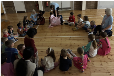
Pass the parcel

Our next Holiday Club Short will be a Christmas Party on 19th December. To register your child please use the QR Code on the advert on page 39.