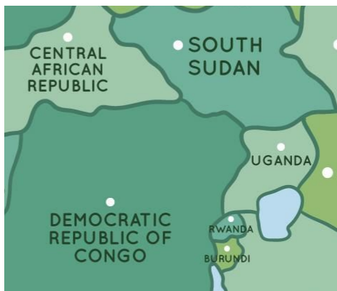
Map of East Africa showing the proximity of Burundi and South Sudan.

One of the most exciting fruits of their work has been the development of a 'mission mindset' in Burundian churches. There is an increasing awareness of the responsibility for everyone to follow the Lord's Great Commission in Matthew 28.19 "... make disciples of all nations..."