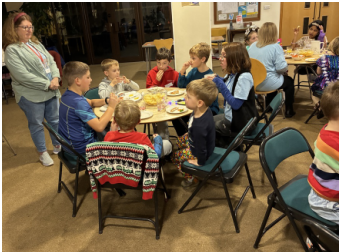
Enjoying pizza and cake