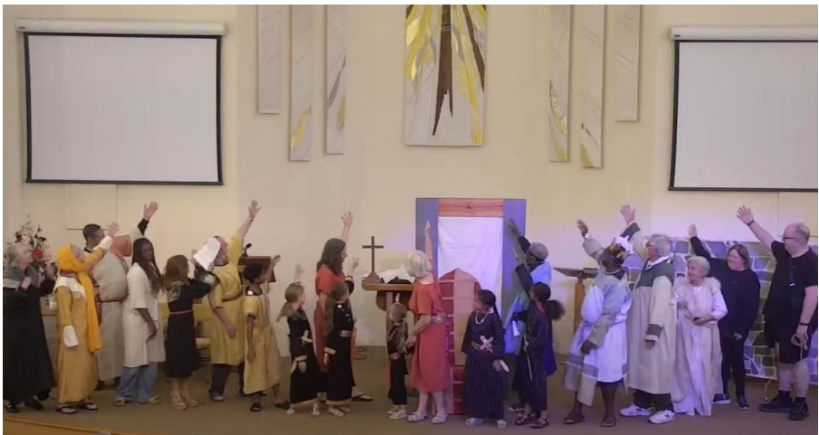
At the end of the play as the congregation applauded, the cast turned to the cross above the altar to give glory to God

The night before his trial, Peter, chained between two guards in his cell, is asleep. The two other guards are on duty at the door. Then, inside the cell, an angel appears, wakes Peter and tells him to get up. As he does so, his