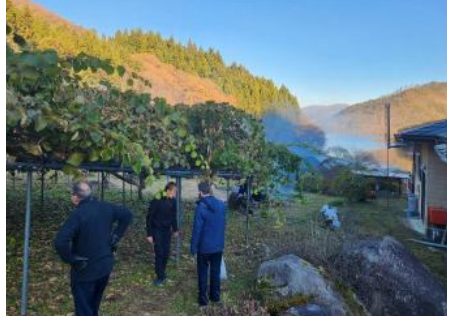
Picking kiwi fruit

Praise God for warm fellowship and the chance to get to know one another better. Please pray for openness to spending time together outside of the church services.